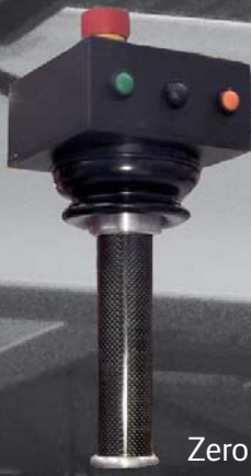
Zero Gravity handle