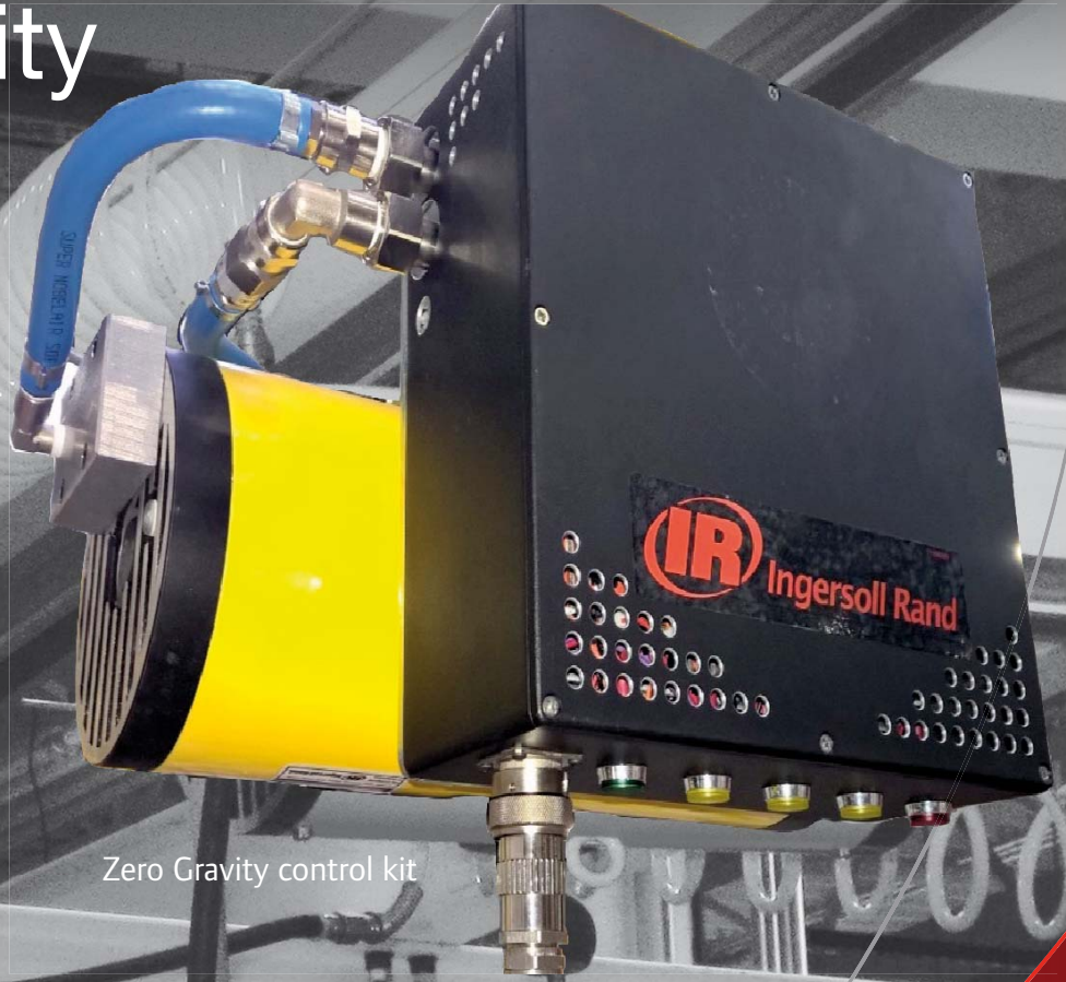
Zero Gravity control kit